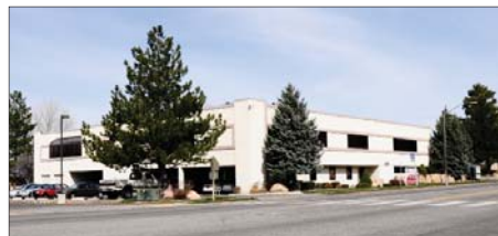
Mountain Alarm 3293 S Harrison Blvd, Ogden, UT 28,988 SF