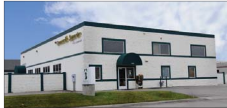
Bonneville Title Plant 1343 W 75 N, Centerville, UT 7,400 SF