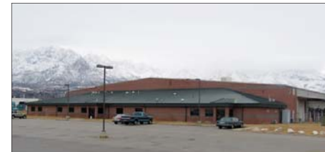
Clifco Metal Manufacturing 2458 N Ruben White Blvd, Ogden, UT 58,000 SF