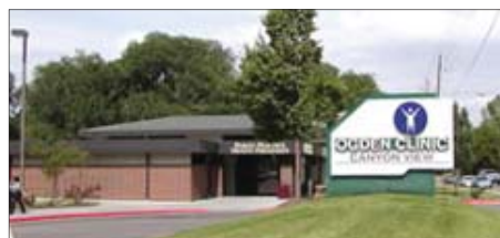
Ogden Clinic 1159 East 12th St. Ogden, UT 13,680 SF