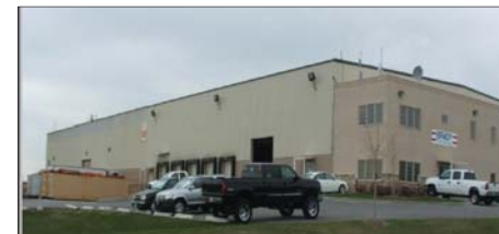
Brody Chemical 6125 W Double Eagle Cir, SLC, UT 41,529 SF