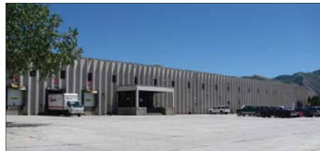
DGS Store Fixtures 959 W Utah Ave, Payson, UT 190,434 SF