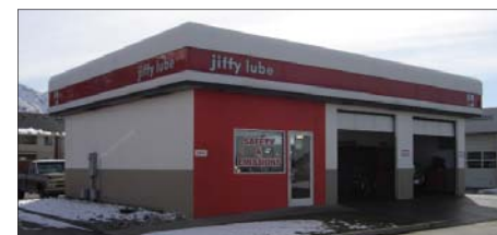
Jiffy Lube 5746 S Harrison Blvd, So. Ogden, UT 2,000 SF