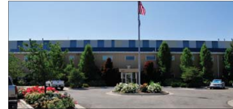
Superior Air 200 W 700 S, Clearfield, UT 324,382 SF